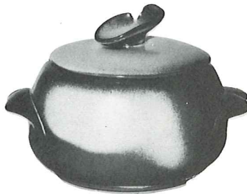
9.25 *4V—2 QT. BAKER/BEAN POT 16.50 *4V/W—BAKER/W WARMER SET