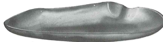
*4P—13" PLATTER 7.75