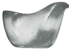
4A—8 OZ. CREAMER 3.25