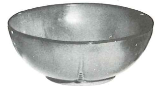
*224—8" ROUND BOWL 6.50