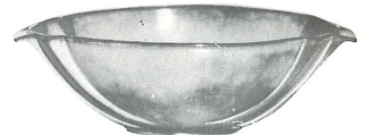
*201—9" BOWL 4.75