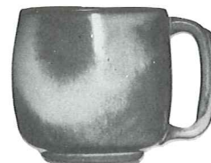
*4M—18 OZ. MUG 4.50