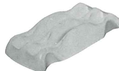
249 TACO HOLDER BOXED 2 PER BOX 10.00 Not Available in Flame