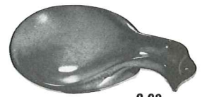
*4Y—6" SPOON HOLDER 3.00