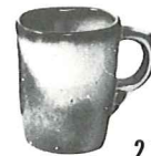
*5CC—5 OZ. TEACUP 2.75