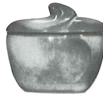
4B—SUGAR WITH LID 5.00