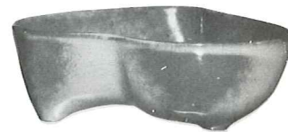
*4N—24 OZ. VEGETABLE 4.75