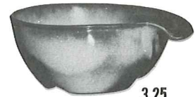
*4X—14 OZ. CEREAL 3.25