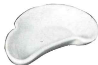
*243—6½" CRESCENT SALAD 2.50