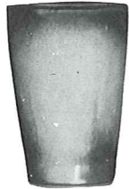
*5L—12 OZ. TUMBLER 3.75