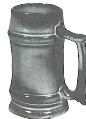
*M2—18 OZ. STEIN 4.50